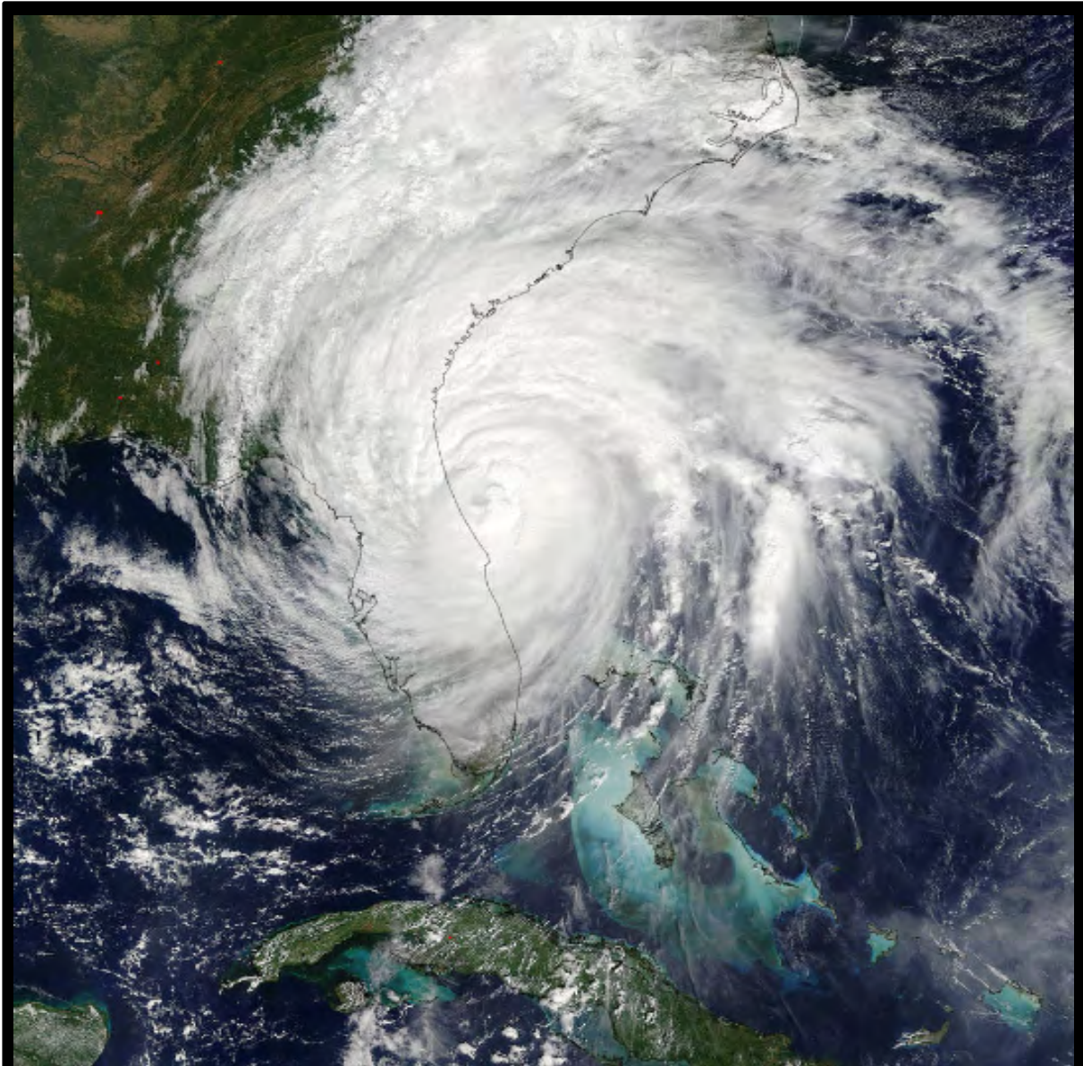
Hurricane Matthew